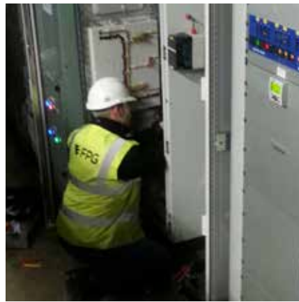
OFFSHORE SERVICING AND MAINTENANCE