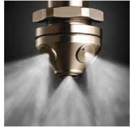
WATER SPRAY / MIST