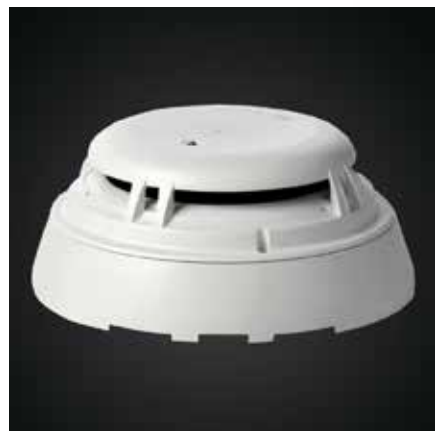
I.S. SMOKE AND HEAT DETECTION