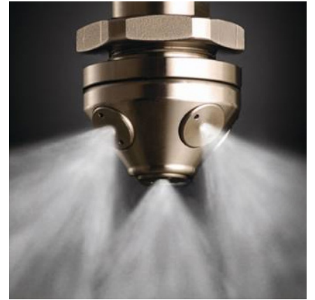
WATER SPRAY / MIST