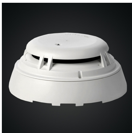
I.S. SMOKE AND HEAT DETECTION