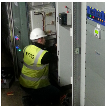
OFFSHORE SERVICING AND MAINTENANCE